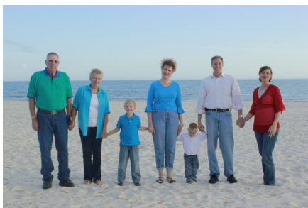
6 out of 7