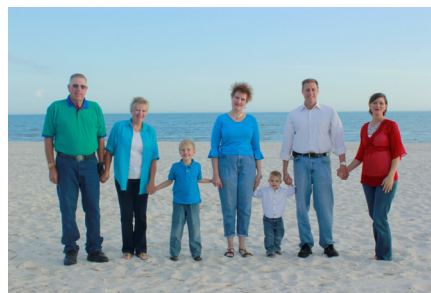
Everybody smiling and looking at camera