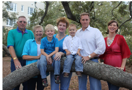
Everybody smiling and looking at camera