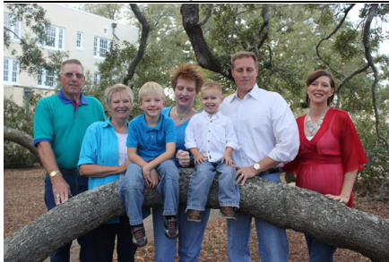
5 out of 7